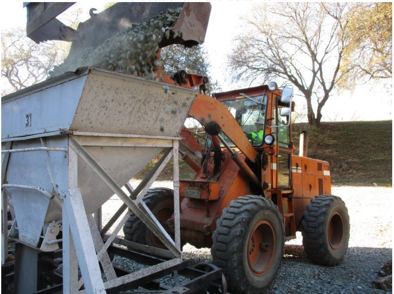
Bill takes over loader duties and fills another ballast hopper