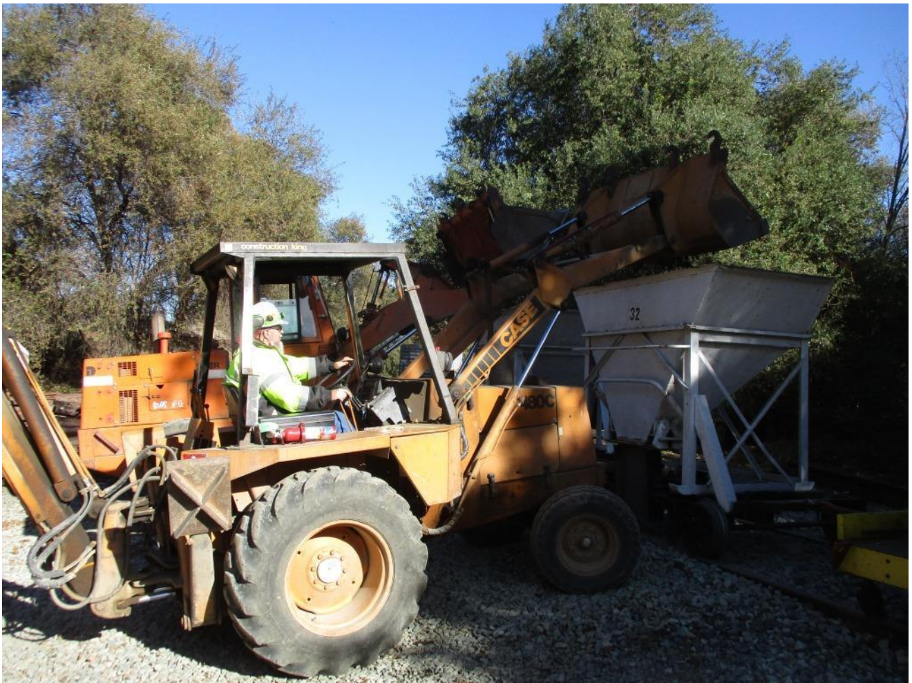
The next load is filled Mike F. on the back-hoe