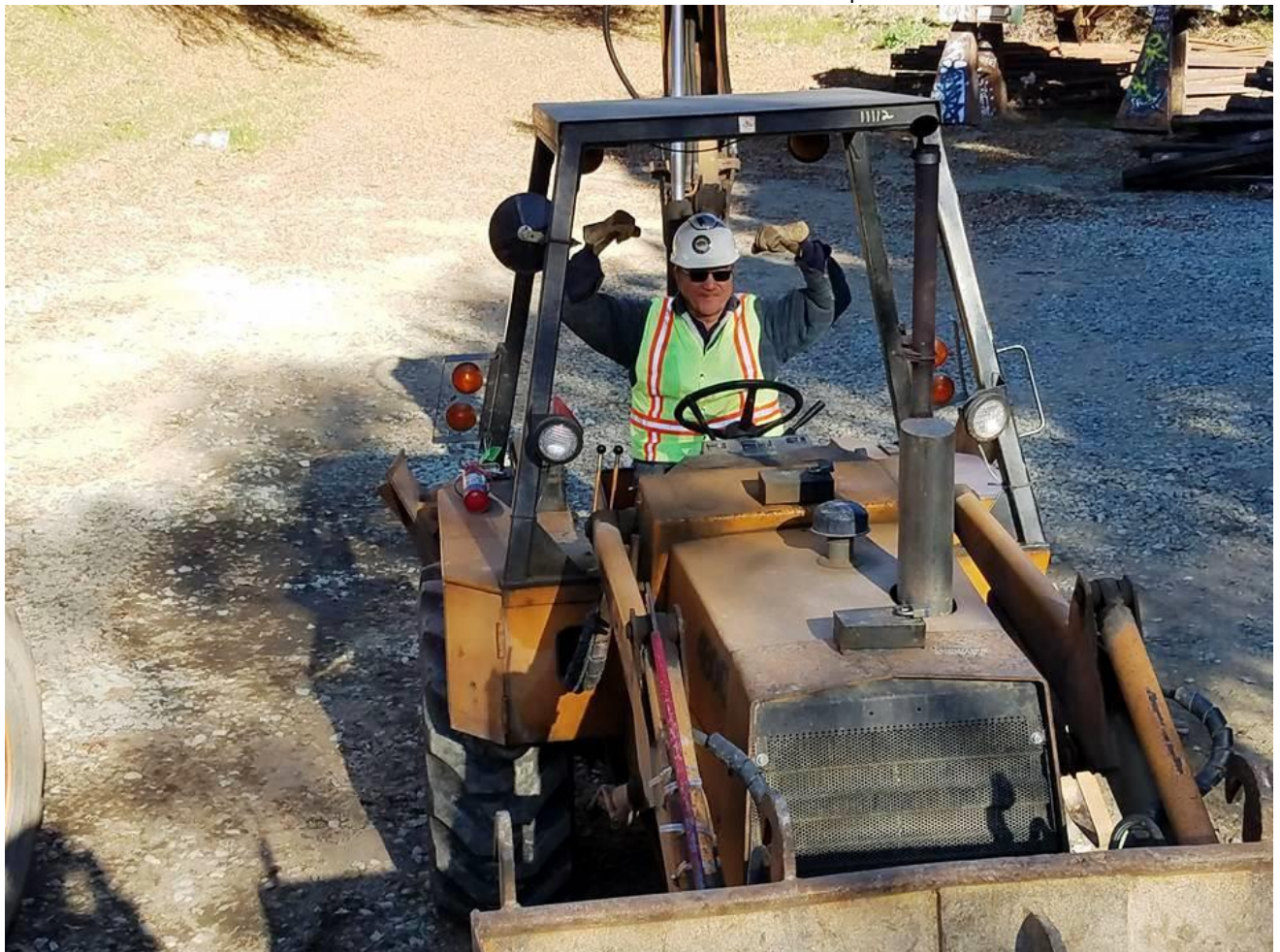
...And quickly transfigurates into Batman!