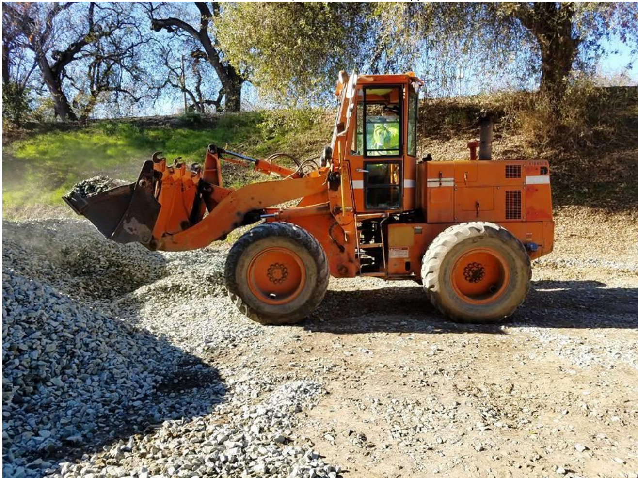
Frank grabs another bucket-full of ballast rock